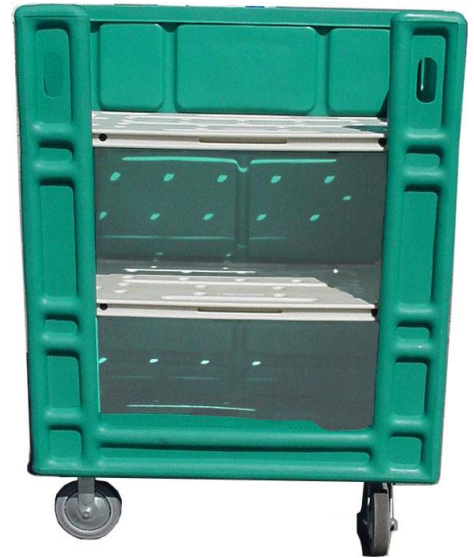
Rolled Top Edge

Strength and long-term durability are accomplished through a unique integrated semicircular rib design and impact resistant linear polyethylene resin. Abuse-resistant 270-degree radius corners, no-sag steel reinforced Poly-Base, and anti-bulging roll top edges provide twice the strength of traditional trucks. This eliminates the requirement for any additional support bars to maintain the truck's shape.