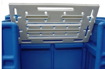
Optional Stainless Steel Pull Bar